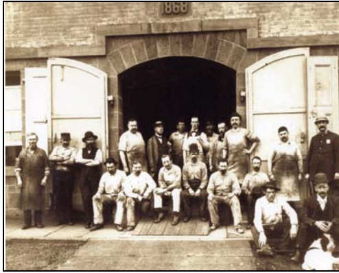
Join our happy crew!